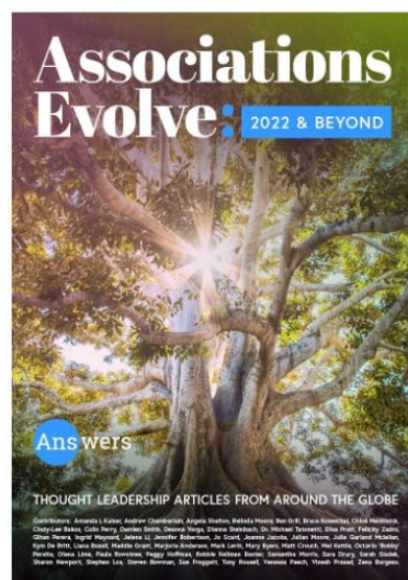
Associations Evolve: 2022 & Beyond