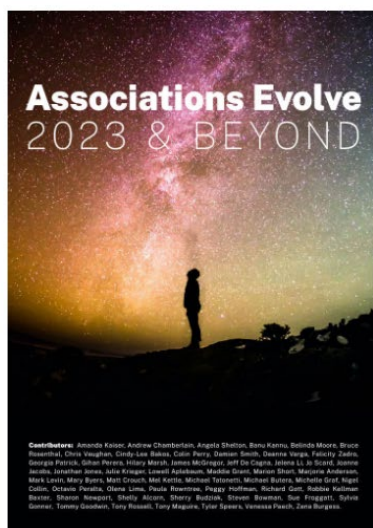
Associations Evolve: 2023 & Beyond